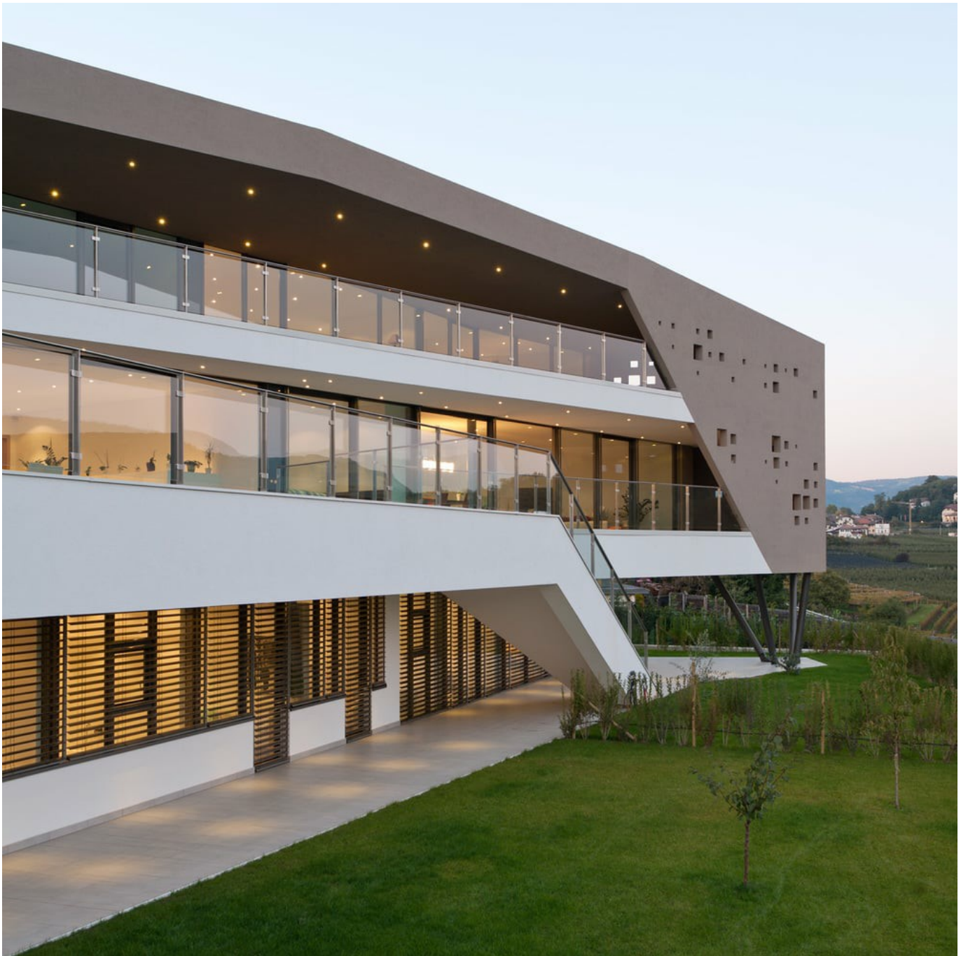
Villa on the South Tyrolean Wine Road Aluminium windows in a single-family house

www.finstral.com/en/references/villa-on-the-south-tyrolean-wine-road/311-3398.html