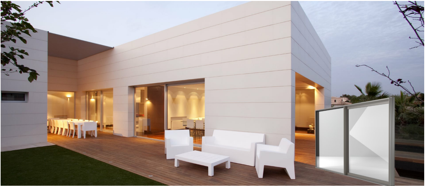
FIN-Slide Classic-line aluminium-aluminium